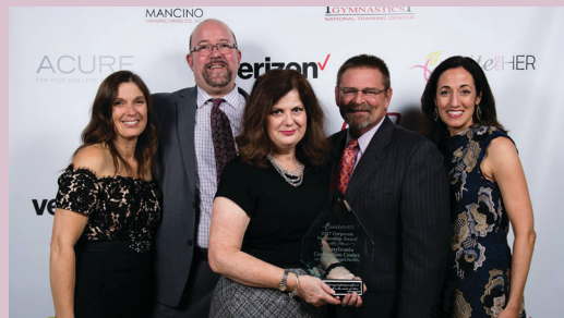
Corporate Partner Award Honoree, The Pennsylvania Convention Center, an SMG-managed facility

Our community does an incredible job organizing their own crowdfunding, peer-to-peer fundraising, and third-party events to promote our mission and raise critical funds. Thank you to all those who organized, attended, and donated!