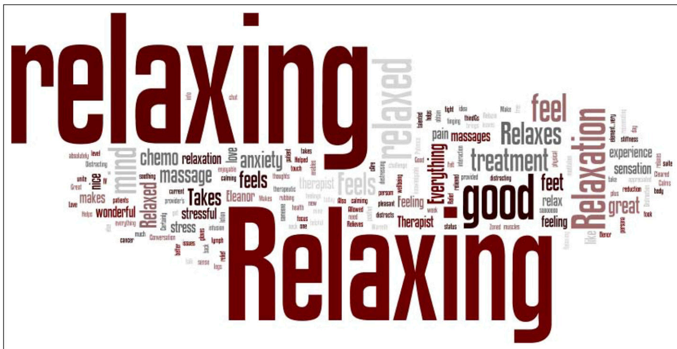
FIG A1. Word cloud from patients' spontaneous written words.